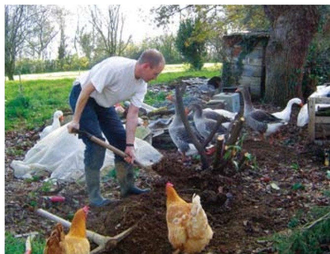
The Land Battle – the problems with our planning process: page 11

WIN DR. MARTENS BOOTS Three pairs to be won each worth £90-£95 Ideal for smallholders Enter our competition on page 41